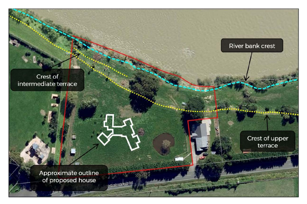
Figure 1: The site plan taken from the expert's report showing the river and terraces, the property boundary and the approximate location of the house (not to scale)

deemed unsafe due to the potential risk of erosion and inundation in this area. The restrictions on the use of this area was recorded in the resource consent notice for the subdivisions. No restrictions were placed in the notice relating to the remainder of the applicant's property.