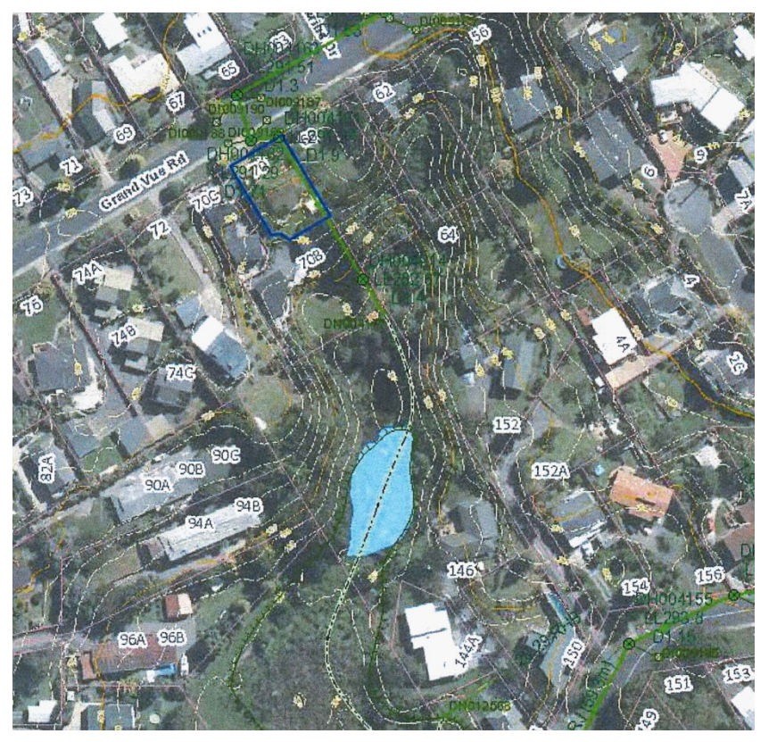
Figure 1: Sites and contours (from Rotorua District Council GeyserView)

2.3.1 The applicant's property lies to the east and southeast of the subject site: