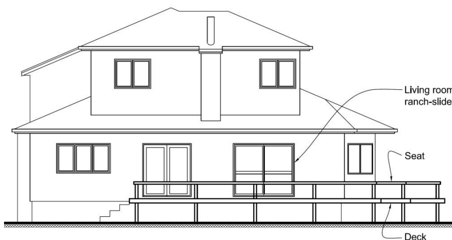
Figure 1: House elevation showing deck

1.1 This is a determination under Part 3 Subpart 1 of the Building Act 1 2004 (“the Act”) made under due authorisation by me, John Gardiner, Determinations Manager, Department of Building and Housing (“the Department”), for and on behalf of the Chief Executive of that Department. The dispute arises because the territorial authority does not believe that the addition of a fixed seat to a deck, that would otherwise not require a barrier, complies with clause F4 “Safety from Falling” of the Building Code 2 (First Schedule, Building Regulations 1992).