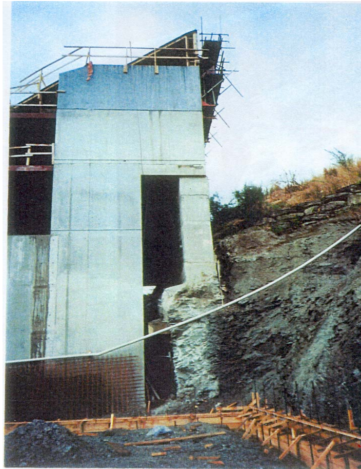
Figure 2: The building in relation to the elemental wall

The elemental wall originally cantilevered from reinforcing steel grouted into the bedrock. Subsequently, as shown in Figure 2, the upper floors of the building were stepped out to the line of the elemental wall. Thus the elemental wall now carries some vertical load from those floors, which prop it at the top against horizontal loads from the overburden.